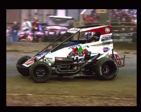
Donny Schatz (with Spike Chassis)