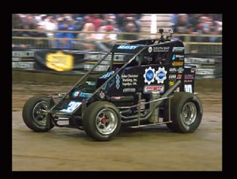
Logan Seavey (with Swindell Speedlab)