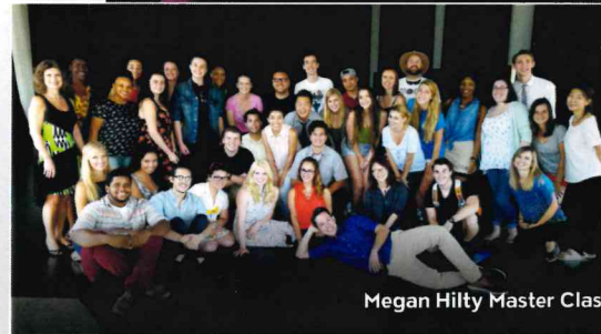
Megan Hilty Master Class