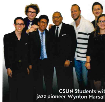
CSUN Students with jazz pioneer Wynton Marsalis