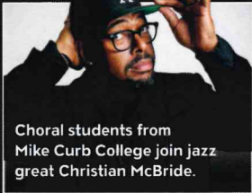
Choral students from Mike Curb College join jazz great Christian McBride.

Thu Feb 2, 2023 | 8pm Christian McBride's The Movement Revisited